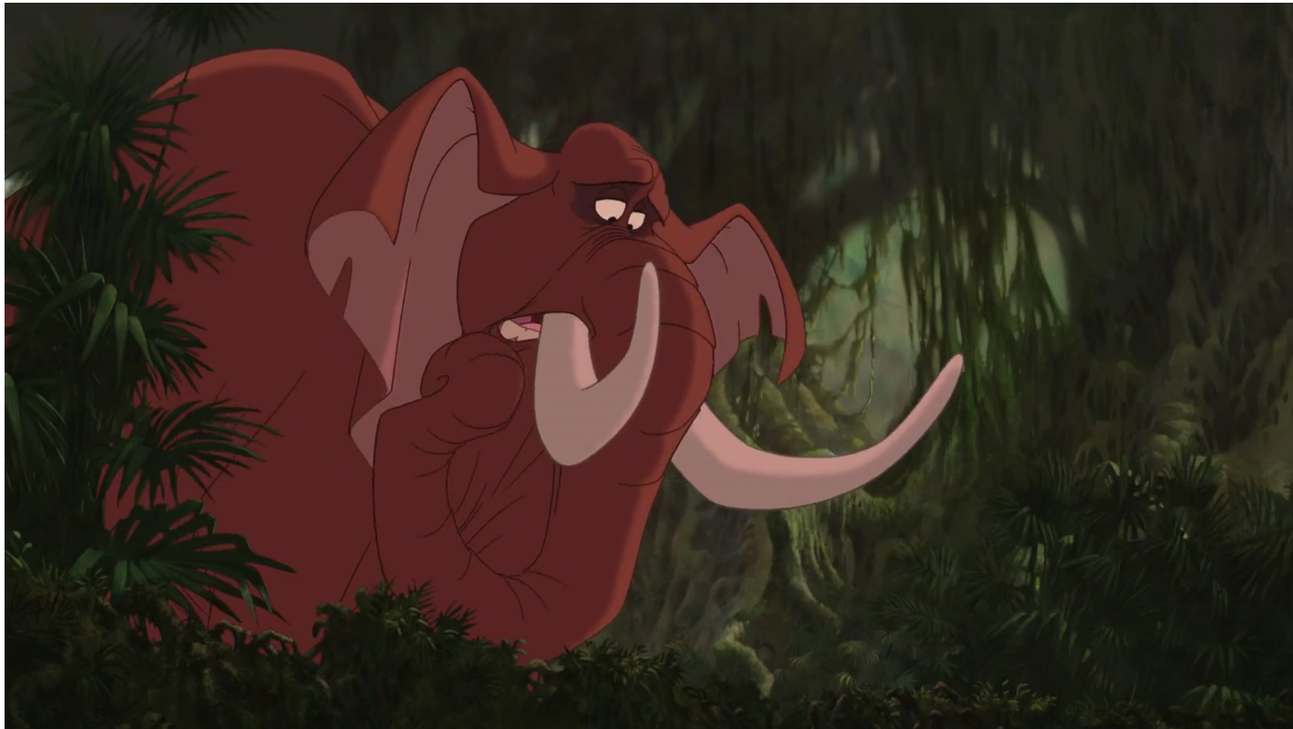
Fig 1. The security team realising that it needs to write a lot of rules.