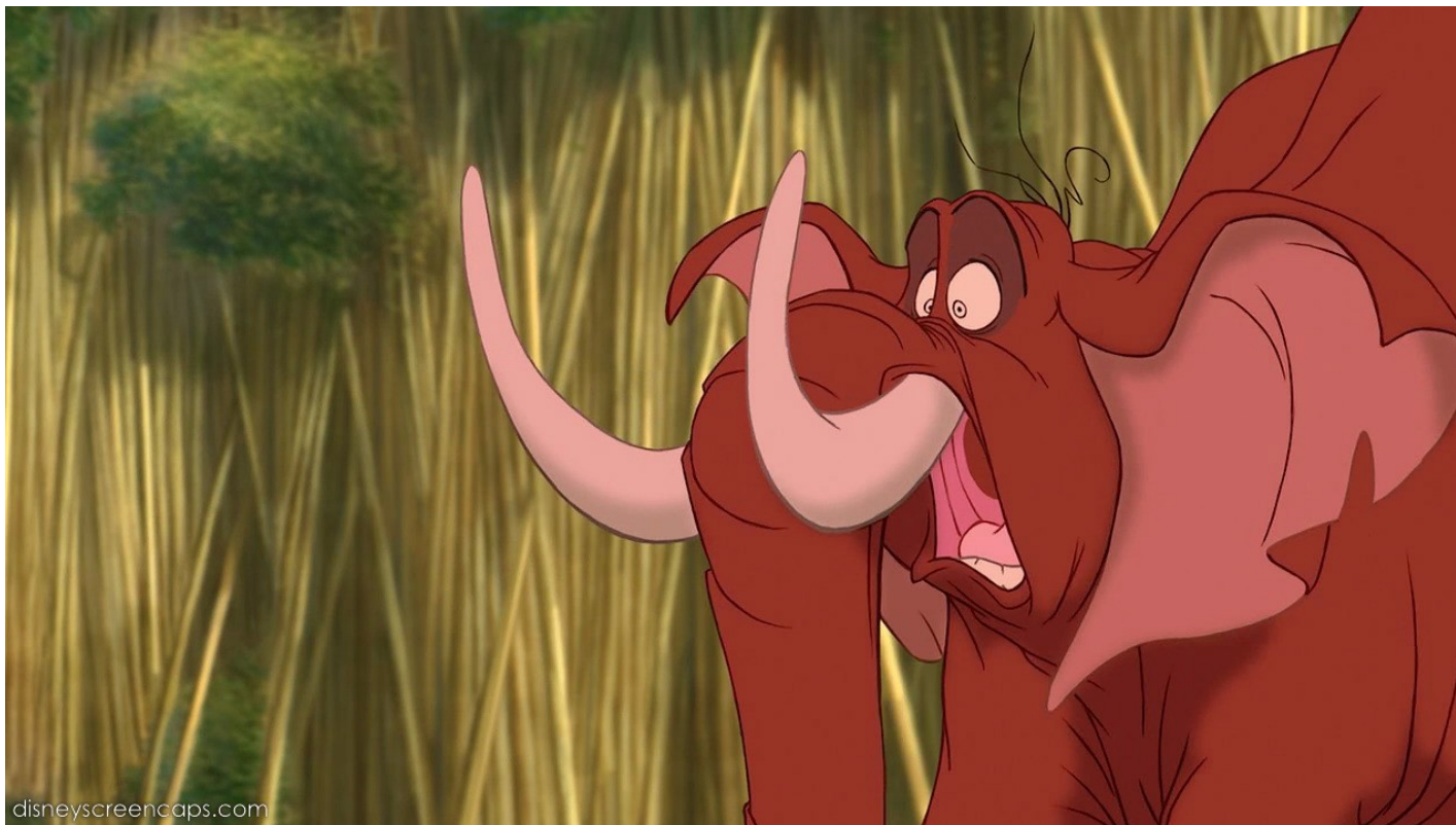
Fig 1. The security team casually reading some php code