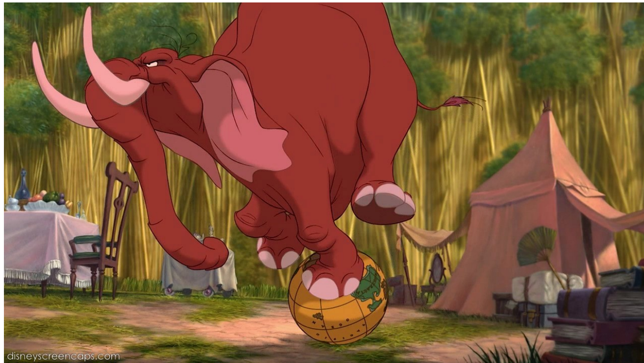
Fig 1. Us, ready to conquer the world with our new project!