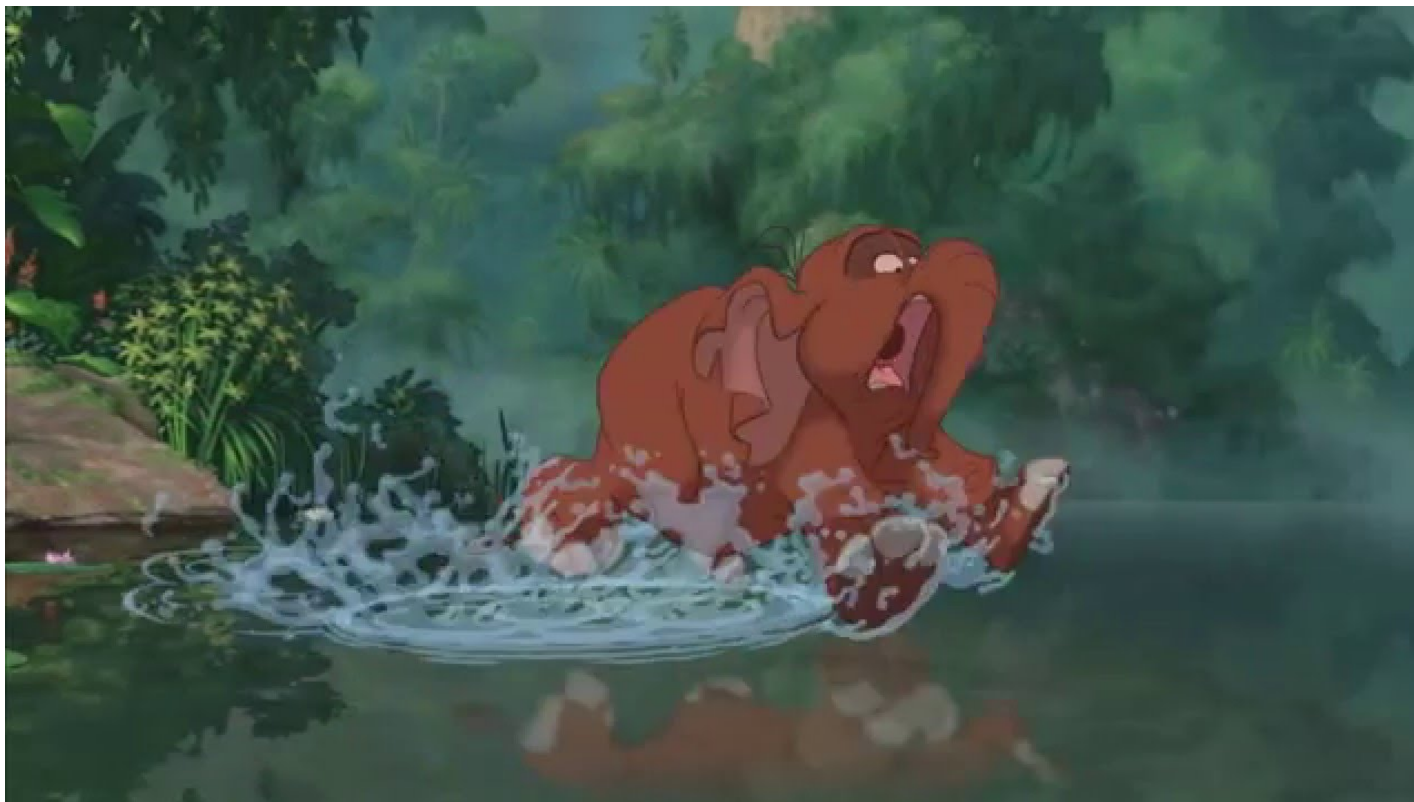
Fig 1. A regular php stack with Snuffleupagus running at full speed.