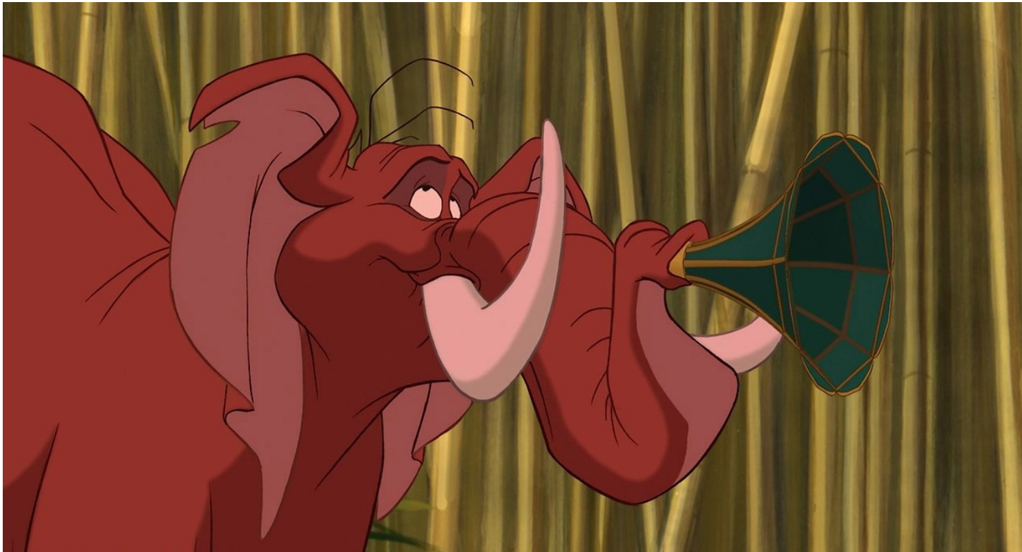
Fig 1. Rant about PHP in 3... 2... 1...