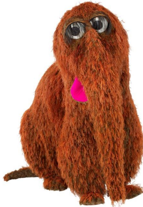
Fig 1. The magnificent Snuffleupagus

» So we wrote our own hardening module, in C!